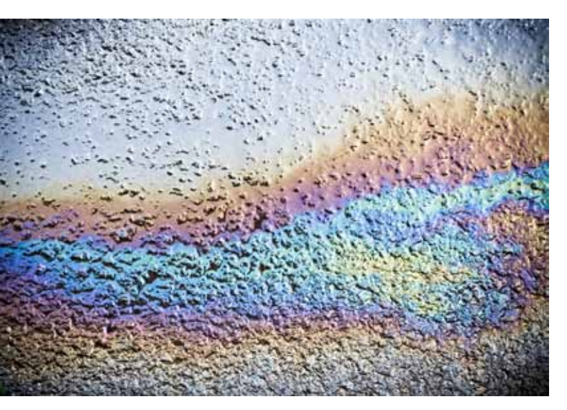
"The safer, biodegradable alternative: Worksafe compliant. Meets and exceeds EPA disposal requirements. Absorbs immediately on contact."